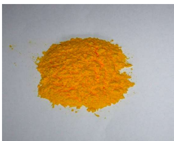
< CELLCOM - ACMP/L02 >

CELLCOM - ACMP series are modified blowing agents. They are specially formulated chemical blowing agent for cross-linked LDPE and PP foam with chemically cross-linking by extrusion and continuous oven foaming process. CELLCOM-ACMP series are well dispersible in polymer compound and it is able to make coarse & uniform cell structure and smoother skin in the sponge.