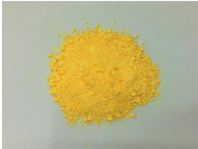
&lt; CELLCOM - AC9000Y &gt;